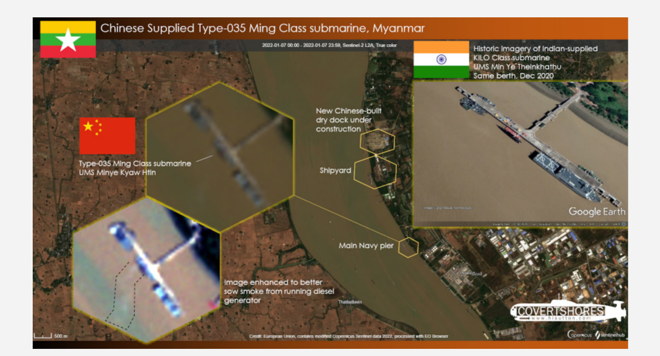
Image 4 : China's dry dock construction in Myanmar along with other markings